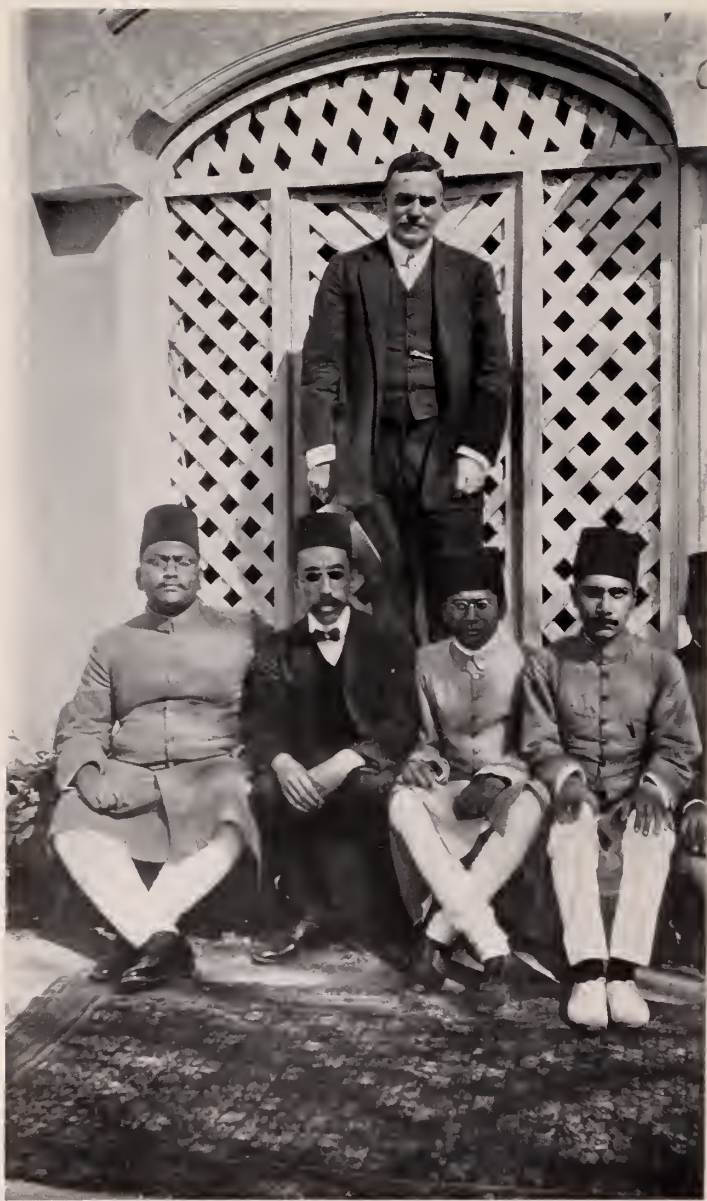
Four Indian princes at Nizam College, Hyderabad